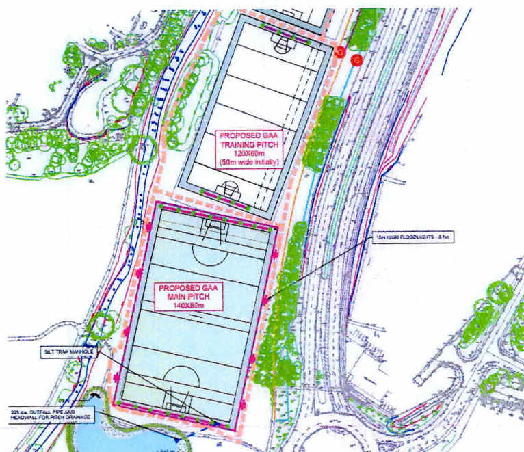
Proposed Final Pitch configuration in Balheary (1 Adult full-size pitch and 1 Juvenile pitch)